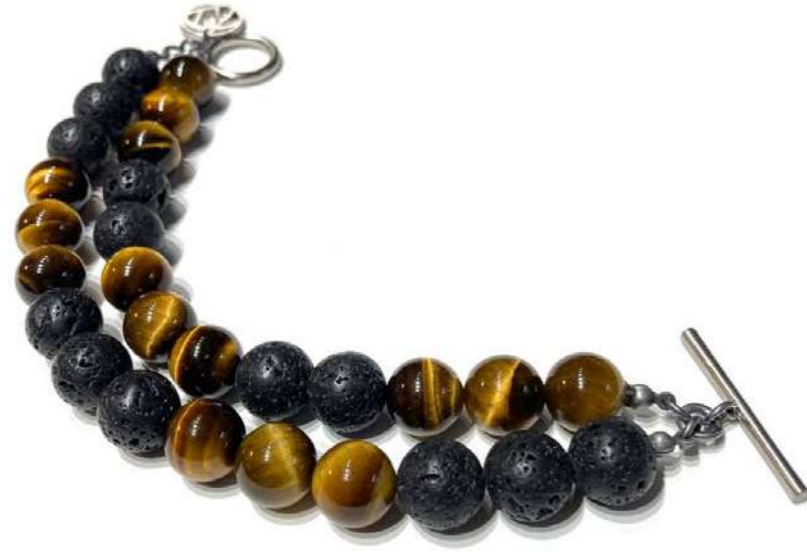
Yellow Brown Tiger's Eye, Black Volcanic Lava Rock